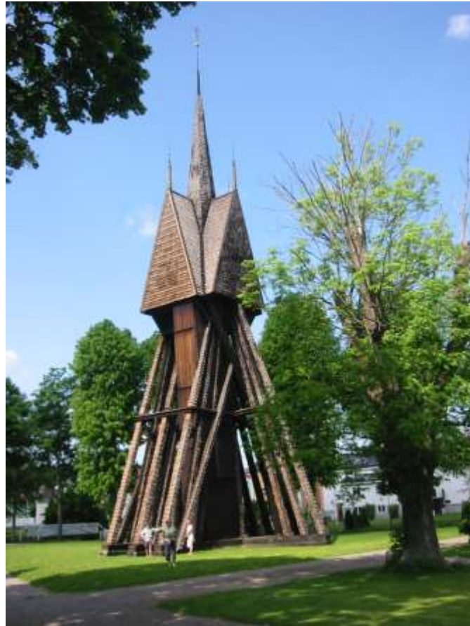
16 th century spillikins propping up the largest bell tower in Sweden

One of the features of the Trollhätte and Göta canals were the bridges. As the canals split Sweden in two, there were numerous, and I swear that each one was different. Some swung vertically up to the left, others swung up to the right. Some swung horizontally from the shore, others pivoted horizontally in the middle of the canal. Some were cantilevered, others on cogs. There was the one that lifted vertically between two enormous towers; the other that moved horizontally along rails, and a further one that lifted vertically in two parts into bascules like Tower Bridge. Most were single bridges but some were twin bridges. It was like there was a rule “We are building a new bridge and you are invited to tender for the design, but it has to be like none other on the canal”. But it sure makes it interesting.