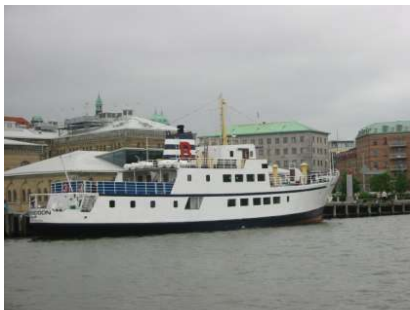
M/S Poseidon – amazingly still intact after the change of helmsman