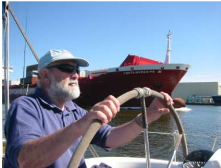
The only navigation hazards in the canal come from behind you

Rendsburg is up a sleepy backwater (which we almost missed) and is a delightful spot. The town is very pleasant, albeit very quiet. About the liveliest place was actually on our doorstep. The restaurant at the marina was humming and we had an excellent meal there in the evening.