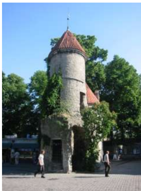
Tallinn – as beautiful as its people