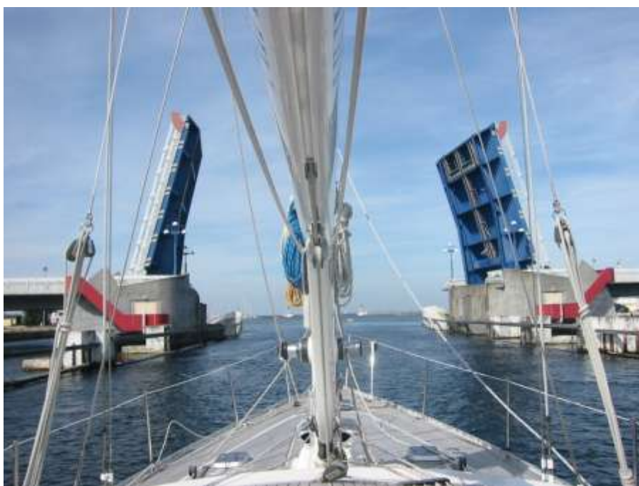
The Falsterbo canal bridge opens - eventually

The south west corner of Sweden has a peninsula sticking out from it. During the war, the Germans laid mines across the strait between Denmark and Sweden, effectively cutting off one side of Sweden from the other to shipping. So the Swedes dug the Falsterbo canal through the peninsula, which cut about three hours off our trip to Copenhagen. Or it would have done had we not arrived five minutes after the bridge had shut and we had to wait an hour for it to open again.