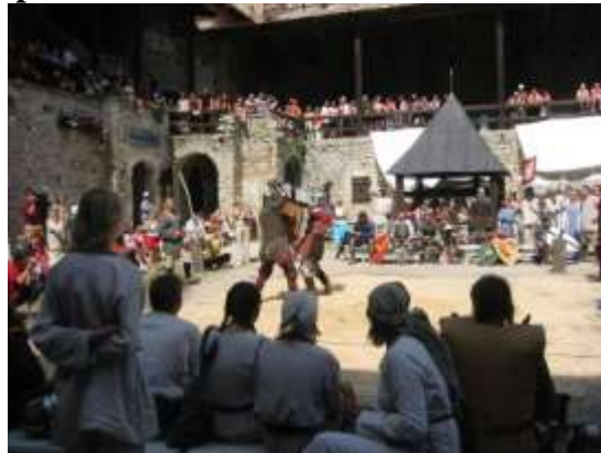
Haapsalu – charmingly medieval

The rest of the town is faded charm with lovely Estonian wooden houses in cobbled streets. Completely unspoilt. At one time the town had been a watering hole for the bourgeoisie and on the shores of a pretty lake was a large wooden tea-house.