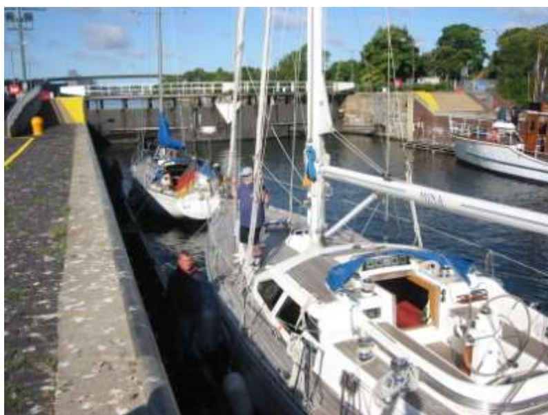
The east lock of the Kiel Canal

3 September. You can theoretically get through the Kiel Canal in one day, but it is a hell of a push and we were to take a more leisurely two days, stopping off at Rendsburg, 20 miles up the canal. The canal has just one lock at each end and, after the traumas of the Göta Canal, the Kiel locks are almost unnoticeable, the rise only being about a metre.