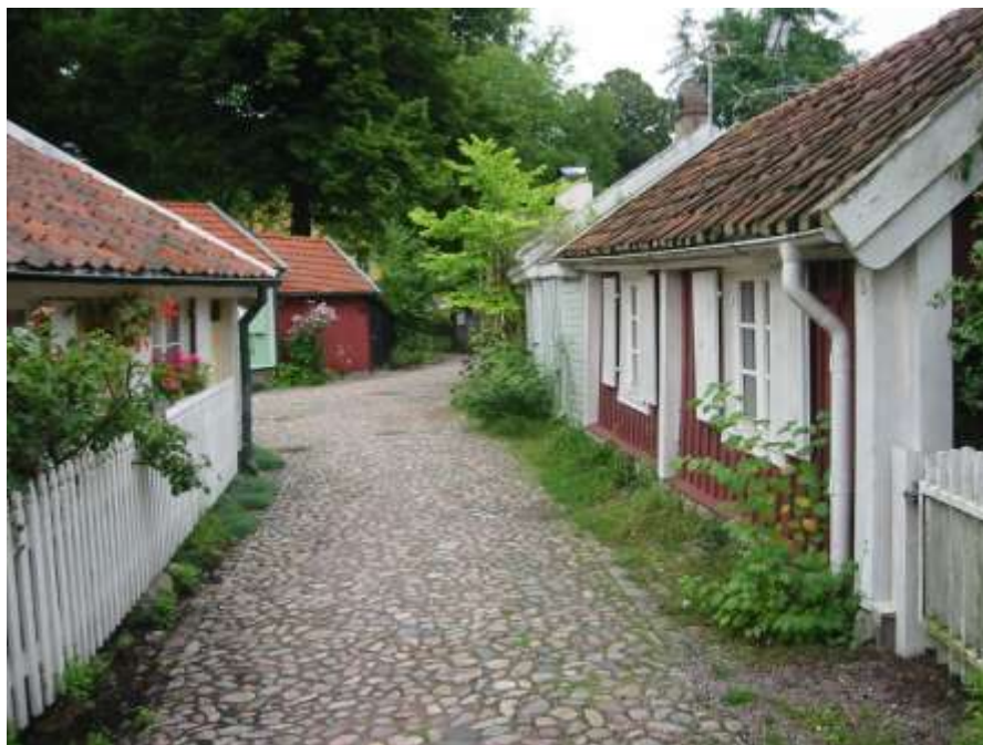
Typical old street in Kalmar

Early evening saw me in the town square for the pop event but, my age showing, it was so noisy I headed off to the wonderful venue of the castle for a performance by a contemporary dance group. Now, I know I am not renowned for my culture, but this was challenging. A bunch of anorexic girls standing in a circle twitching, whilst some dragon caterwauled discordantly offstage. It was absolutely ghastly. So back to the town square where the pop groups had all gone off for an early night, and all the locals had come along with their deckchairs and Thermos's for an open air cinema displayed on a vast screen covering the entire front of the cathedral – which I have to say was great, notwithstanding I didn't understand a word of it.