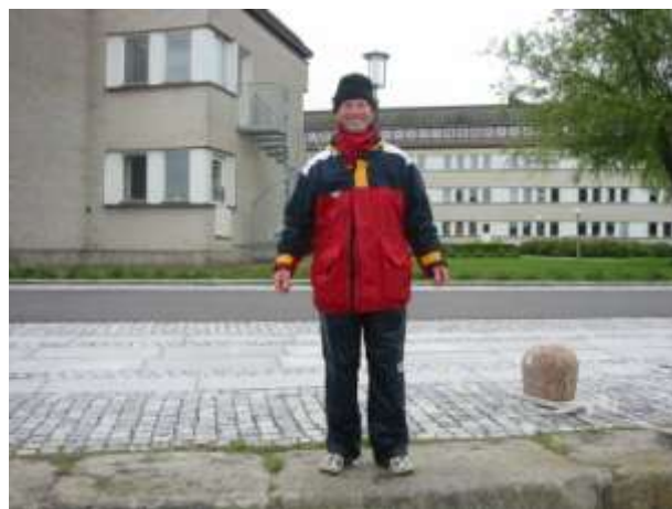
The multi-tasking Chief Fire Officer - but not looking quite so smart after a dunking