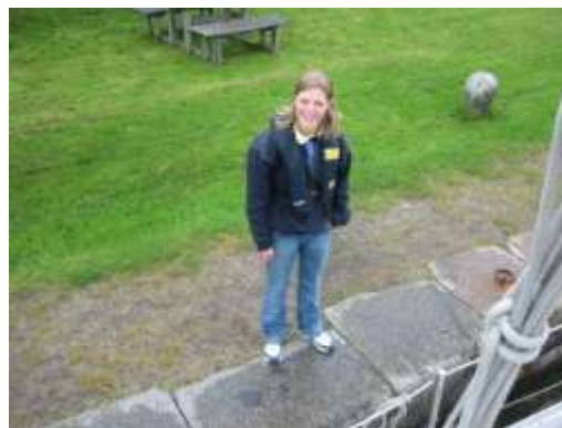
Just two of the Gorgeous Göta Girls

At one point we swung round a bend to find a vintage passenger ship, the SS Sandon , pretty much blocking the canal. Hanging down the sides of the ship were old tree trunks which they use as fenders, rolling down the hull as the squeeze into the locks. Adhering to the international rule of the road, I moved to the starboard side of the canal and stopped to let her pass. She gave two loud blasts on her horn – the signal for “I am altering course to port”, ie directly towards us. Obliging I moved over to the other side of the canal where it became obvious why the ship wanted to use the “wrong” side of the canal, as we almost went aground. Edging past us, the captain of the Sandon opened the bridge window and, much to the amusement of his passengers, shouted to me “Not only do you have lots of money and a beautiful boat - but you have lots of common sense too!”, and with a farewell blast of her horn she steamed on her way.