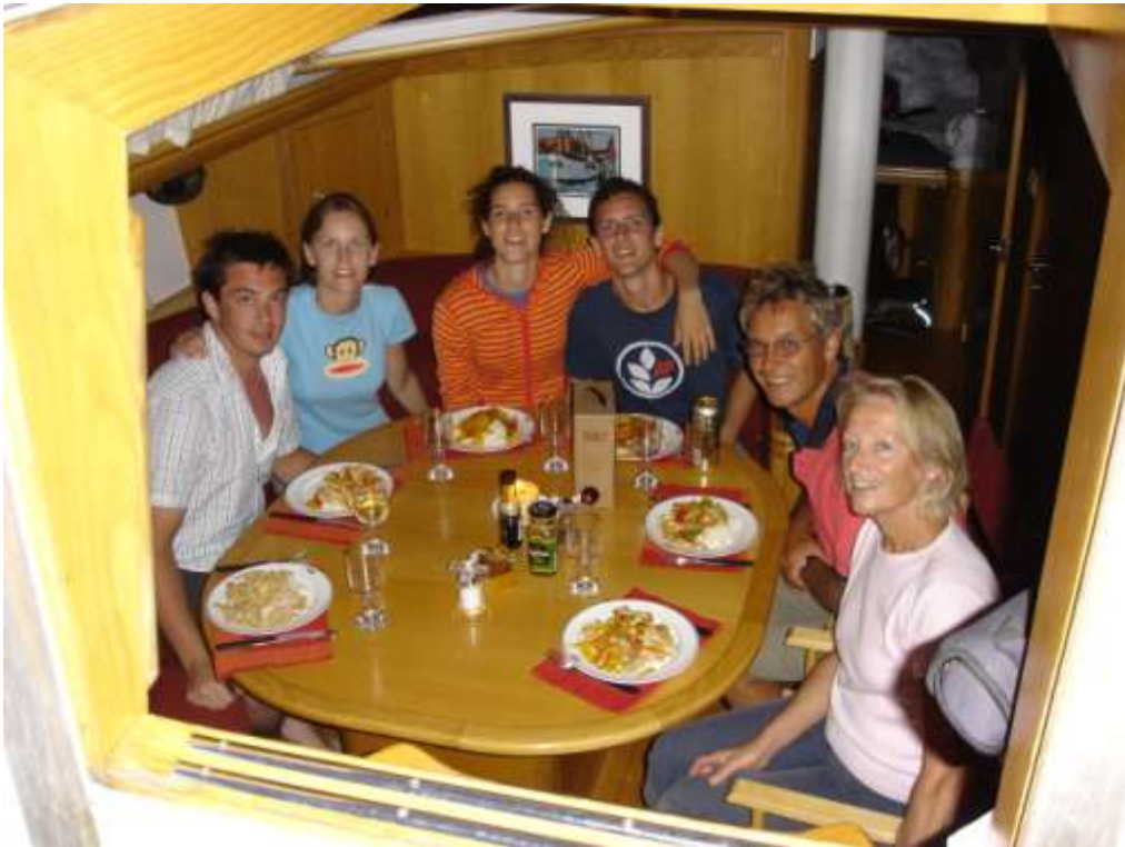
A full house for dinner

Continuing our passage, we saw, for the first time on the cruise, some harbour porpoises slowly undulating their way through the water. But, as always with this species, they showed no interest at all in the boat in their midst. Hundested, at the entrance of the Isefjord which we didn't have time to explore, is an uninspiring place but a convenient stopover and one of the few along this stretch of coast.