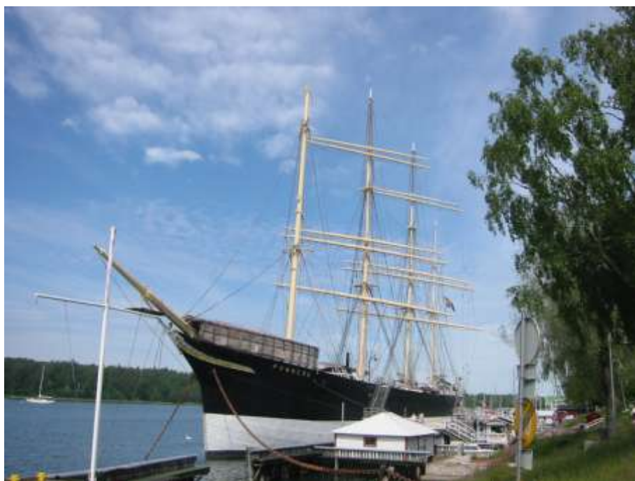
The Pommern – in use until 1939