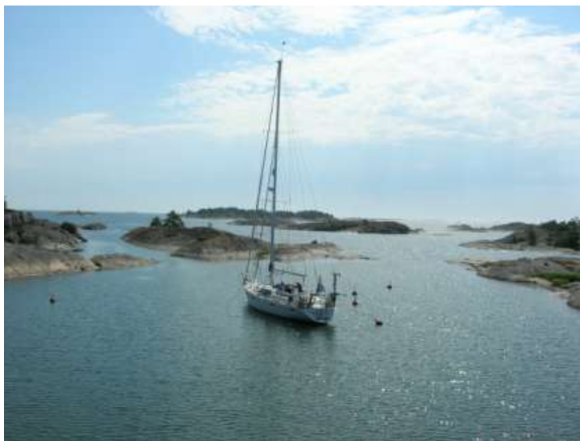
Our bow is pointing to the very narrow and rock-strewn exit channel

7 July. When I awoke at 0730 there wasn't a breath of wind, so I got the dinghy down and with a long boat hook sounded the entrance to find where the rock was that we hit on the way in. I couldn't find it at all but established that there was deeper water on the extreme east side of the very narrow channel. That was the line I would take on the way out. Some clouds were building in the north and the ensign fluttered as a light breeze picked up. Within five minutes we had 25 knots of wind across the deck. Not a moment to lose. We cast off and made for the narrow channel, but we had a problem. I had to go slowly just in case the rock reappeared but, going slowly, the wind was pushing me sideways into the hard granite at the side of the channel. Reluctant to find myself pinned to the rocks, I had barely got my nose into the channel when I decided to abort and we tied up once again. I called Turku Radio on the VHF and they obligingly gave me the forecast of 9-15 m/s (18 – 30 knots) declining later in the evening.