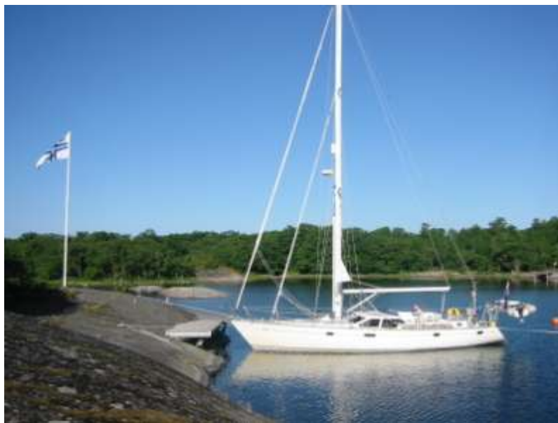
One of the NJK club harbours – with flag!

1 July. We were lucky enough to have temporary membership of the Nylandska Jaktklubben (NJK). The NJK is the premier Finnish yacht club and they have a dozen or so private harbours scattered along the Finnish coast. All in the most beautiful secluded locations, each island has a small club house and a private wood-burning sauna nestled amongst the trees beside a bathing platform off the rocks into the cool pure unsalty Baltic. The first of our NJK club islands was Kråkskär, 30 miles south west of Turku. The whole of Scandinavia has a thing about flags verging on the obsessional. Give a Scandinavian a square metre of land and the first thing he will do is to erect a tall pole and run a flag up it. And so every NJK island has a flag pole and adherence to etiquette is strictly observed. The first member to arrive on site hauls down the “no one in residence” pennant and replaces it with the club flag which is kept in the club house. The last member to leave reverses the process.