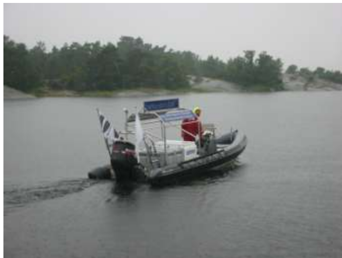
Byttan was rather less isolated than expected – the grocery rib plies his trade