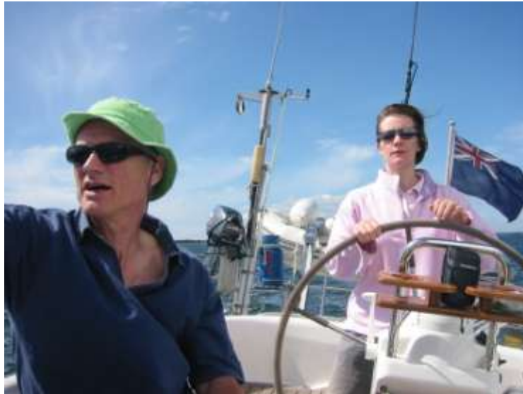
Mina 2 's new skipper and helmswoman