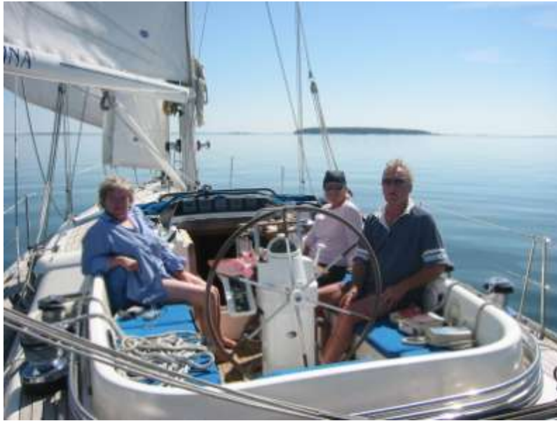
Hot, cloudless and no wind – but plenty of islands.