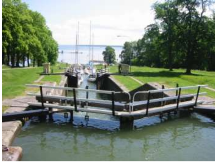
Looking down the 8-lock flight to Lake Roxen

14 June. We awoke to another hot and cloudless day. We had a late start as a flotilla of boats had to make their way up the staircase of locks before we could head down. Standing on the boat at the top of the flight of locks looking down 100 feet to the lake below was bizarre.