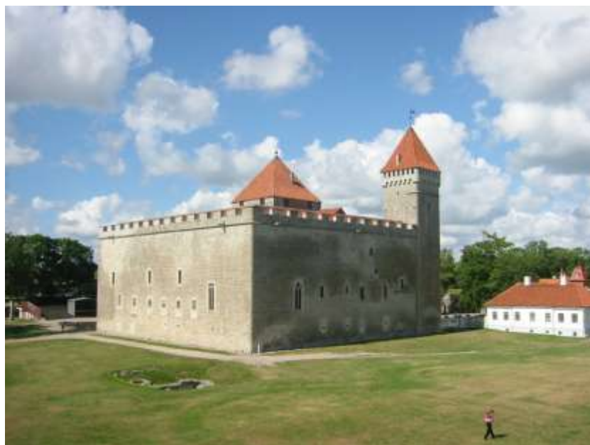
Saremma Castle – pretty on the outside, scary on the inside

once as part of the inquisition. The locals trapped him into an affair with a local girl and then, as punishment, bricked him up in a room in the castle. Sure enough, a couple of hundred years later, they were carrying out some work, pulled down a wall and there was his skeleton sitting in a chair. The bishop, who covered a wide see, used to turn up at the castle a couple of times a year and part of his duties was to judge cases of serious misdemeanour. He normally found the culprits guilty and the sentence, carried out immediately, was to chuck them down a well with a couple of lions at the bottom. No appeal. No messing.