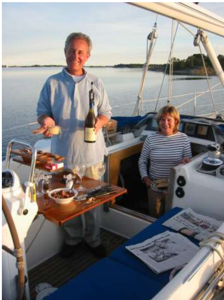
Pre-prandials before the smoked fish gastro-dinner