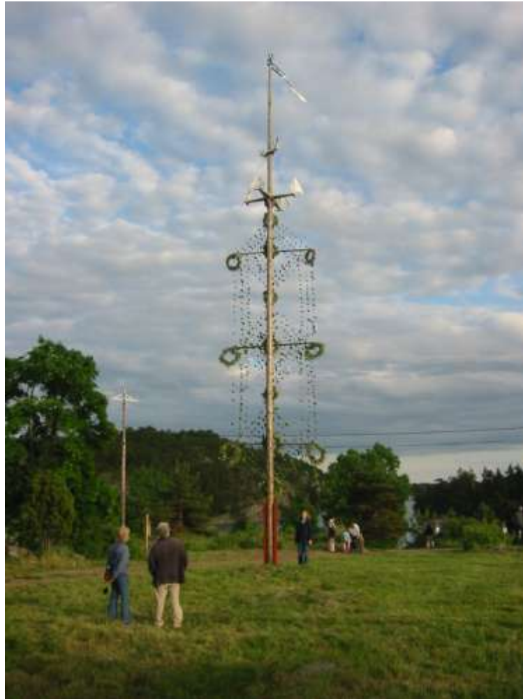
Dånö's midsummer maypole

25 June. We had a brilliant sail from Dånö to Käringsund on the island of Eckerö in a stiff F6 on the beam. Käringsund is a charming old fishing village with lots of old wooden boat houses - great for Charles to sketch. There was also a mobile floating sauna hut which was a first. Basically a small wooden pontoon with a tiny sauna hut on it; a bathing ladder and an outboard strapped to the back. Hire it, take it to the middle of nowhere, and enjoy the peace and privacy. Perfect. Conveniently, the large ferry terminal to Sweden, from where Jane and Charles were to leave the following day was just a short walk away.