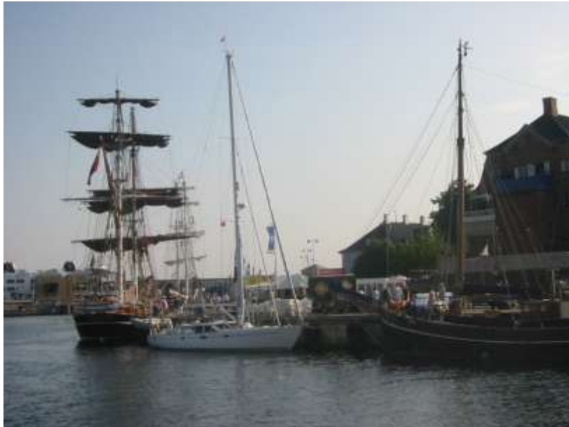
Mina 2 holding her own amongst the tall ships

In the grounds of the castle, as part of the festival, were marquees with stalls selling all sorts of marine paraphernalia. One stall was manned by a bearded and toothless Norwegian fisherman selling marine antiques. My eye was drawn to a couple of large wooden blocks. Surprisingly, given we were in Sweden, everything on his stall was priced in Norwegian krone but we negotiated a price which seemed acceptable to him (judging by his toothless grin) and seemed good value to me. Another memento of the trip.