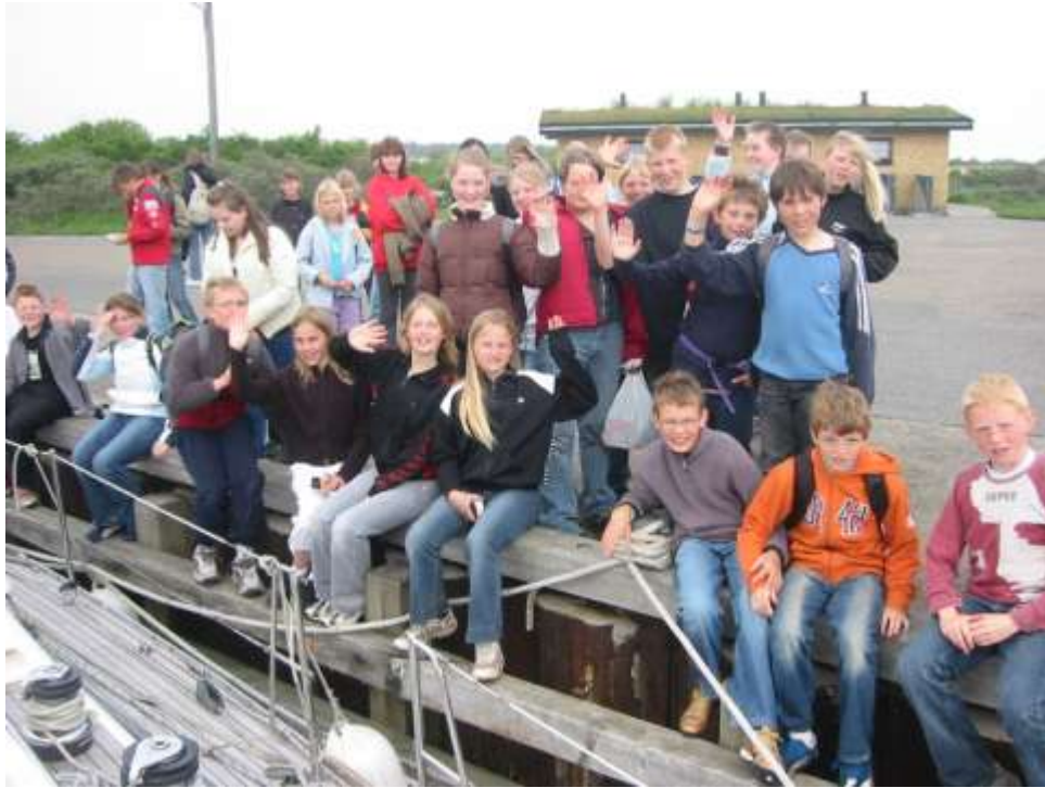
The Mina 2 fan club

Having waved goodbye to our young fans, we then had the problem of getting out of the miniscule harbour. The wind was still pinning us onto the harbour wall, so the only way out was to employ the noble and ancient art of warping. We launched the dinghy and took a stout line over to the far quay and winched ourselves through 90 degrees. Having turned the boat, we then motored out of the harbour astern with about half an inch clearance on each side. A number of people had congregated on the quayside to watch the mad Englishmen destroy their harbour, but I am pleased to say they were disappointed. It turned out to be a textbook manoeuvre.