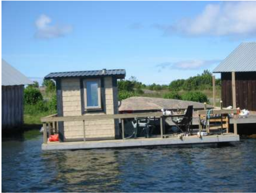
The mobile floating sauna