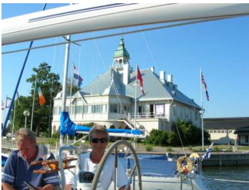
NJK clubhouse and marina in Helsinki

Our expectations of Helsinki were not great. We had heard that it was very provincial in comparison to the other capital cities and rather dull but, whilst it can't compare with Stockholm (few cities can), we were pleasantly surprised. Helsinki has a lively, friendly buzz to the place and the centre is dominated by not one, but two cathedrals: one Lutheran and one Russian Orthodox and clearly they had both attempted to out do the other. They were impressive to say the least.