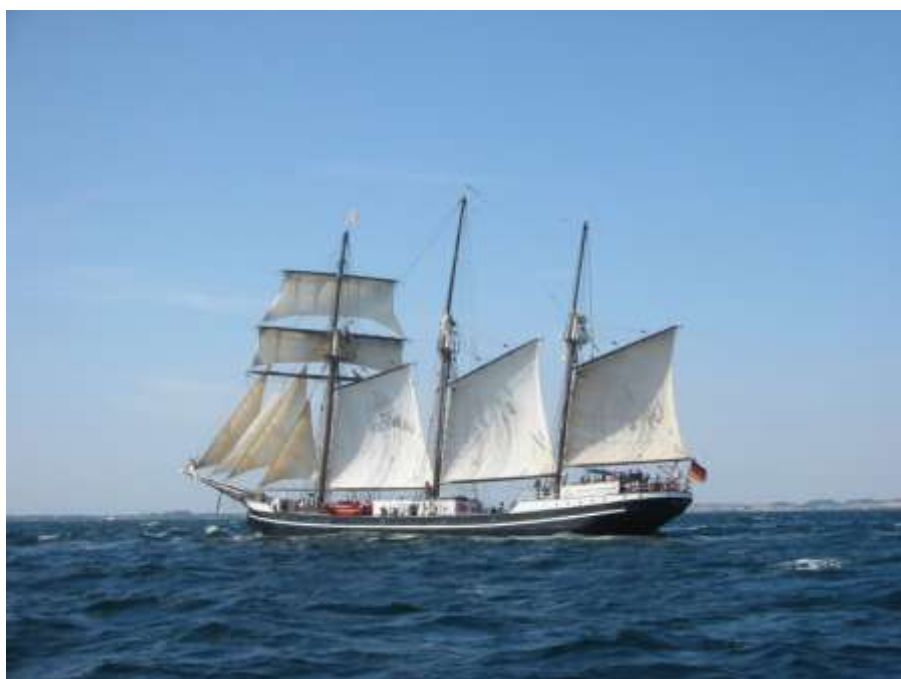
The Baltic seems to be full of sail training ships

This strategy worked. Yes it was very wet on deck, but the ride was not too uncomfortable and the angle of heel moderate so, with me breathing a sigh of relief, we plugged on. In the event the wind backed towards the south east and, as we turned the corner towards Kiel and came into the lee of the land, we were able to get out all the sailcloth and we had very satisfactory, very fast reach for the final leg.