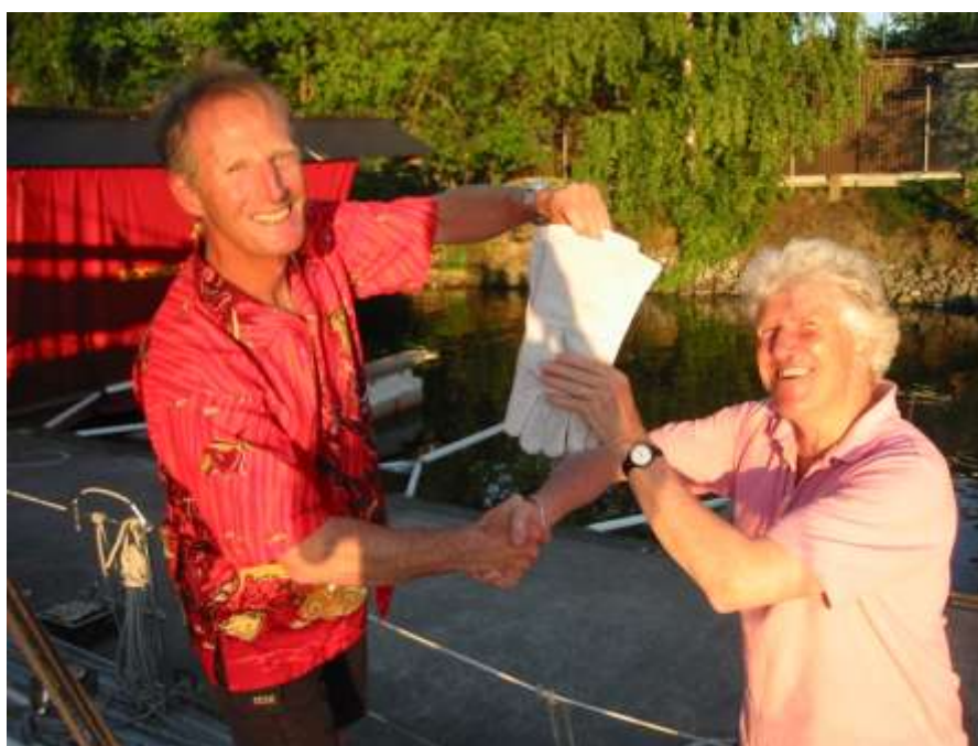
The insignia of the Chief Fire Officer are formally transferred