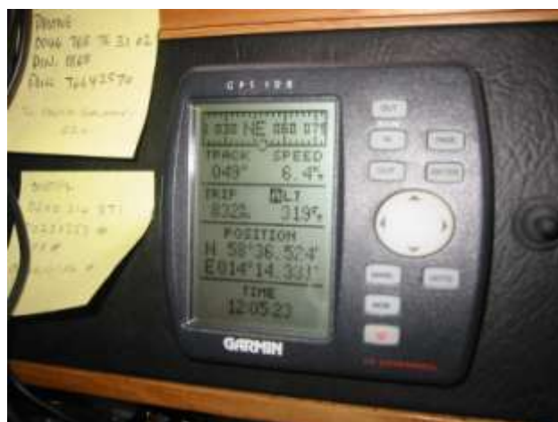
319 ft above sea level – for the first, last and only time

11 June. We left Töreboda and passed through the last of the uphill locks, reaching our highest point of more than 300 feet above sea level, certainly the highest our ocean going vessel had ever been or was ever likely to be.