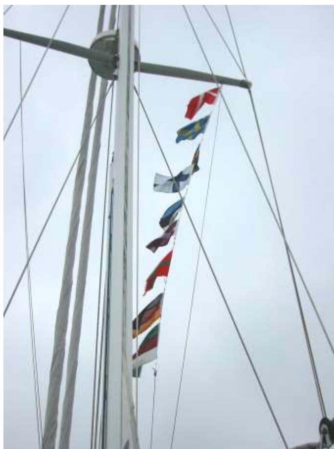
Mina 2 's bunting

I gathered that it was a tradition at the Meet to hoist the courtesy flags of the countries one had visited that year. This was my chance to show off as I whipped nine flags up into the crosstrees. Granted, there were only six country flags (Denmark, Sweden, Finland, Estonia, Latvia and Germany) but I put up the three island flags of Åland, Bornholm and Helgoland for good measure. Mind you I was completely upstaged by another boat on the raft that had about a dozen flags including Canada, USA, South Africa and a large number I didn't even recognise.