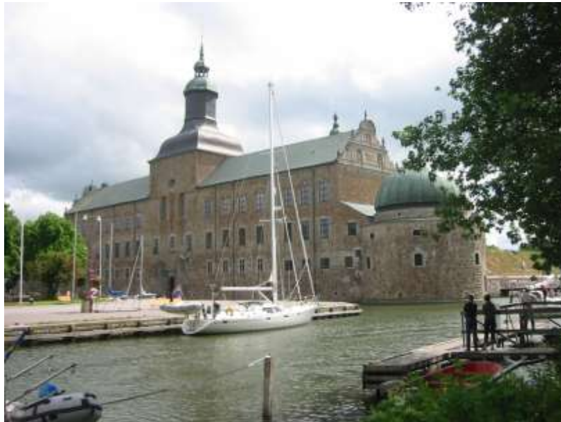
Vadstena castle – the quayside is actually part of the moat

the patients head to stick out of. You shared the bath with a large number of electric eels. This was only one of the instruments of torture on display. If you weren't insane before these treatments, you certainly would be after!