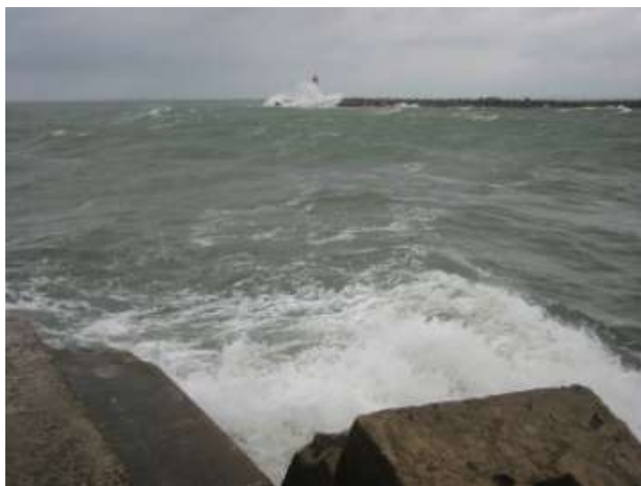
Ventspils harbour entrance – glad we weren't out there

the crew exhausted. They said they had been experiencing storm force winds and mountainous seas. We had forty knots of wind across the deck in harbour and the weather was not forecast to improve, so that was it. I decided that we were to defer our crossing until the wind abated. Instead we went for a crazy walk down the beach. Normally full of happy families paddling in the still waters, we were standing at 45 degrees being sand-blasted by the violent winds, the beach having been transformed into a boiling, crashing nightmare of waves. I was very pleased we were not out at sea in those conditions.