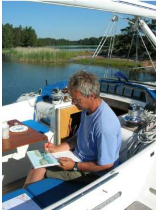
The skipper finds time to paint

different techniques and, whilst they still looked rubbish, they are less rubbish than they were. Whilst it is now two years since I had a proper job, I still have difficulty throwing off the puritan work ethic, and spending most of the day just relaxing and painting seemed sinfully self-indulgent, but I guess I'll get over it eventually.