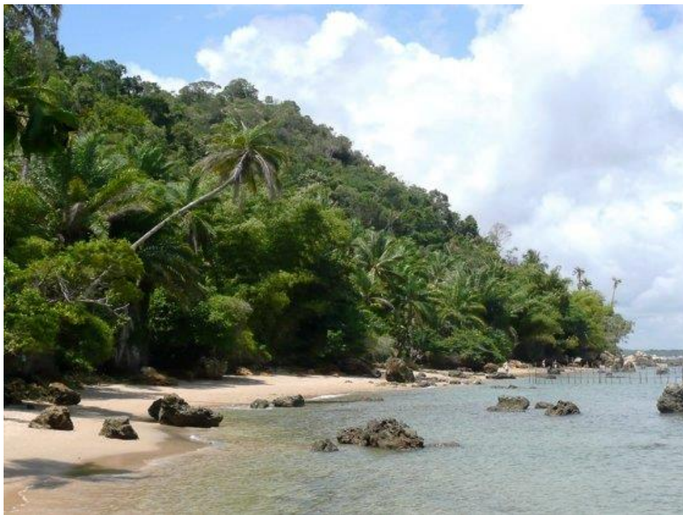
Morro do São Paulo