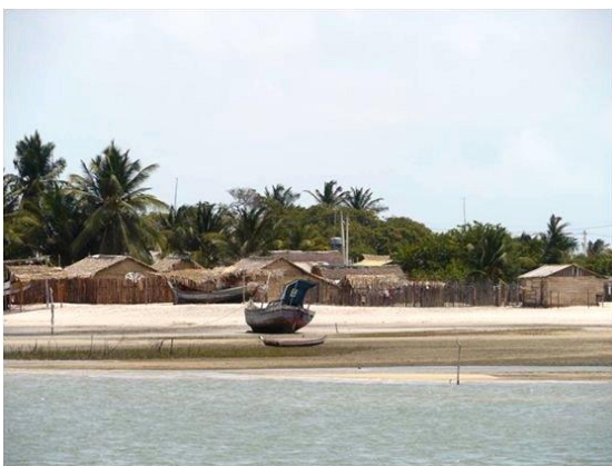
The village on the beach

We had by now caught up with our schedule and with only one more passage of 600nm to get Sally and Lawrence to their departure point of Kourou in French Guiana we were to have the luxury of staying here for four days. None of us wanted to leave. The epicentre of the small village is the small bar/store on the beach, just opposite where we had anchored, and where we slowly got to know the inhabitants. In between visits to the village, we walked over the wind-shaped dunes which were every bit as varied and beautiful as the icebergs that I had seen just a year before. It is quite the most enchanting place I have ever been to.