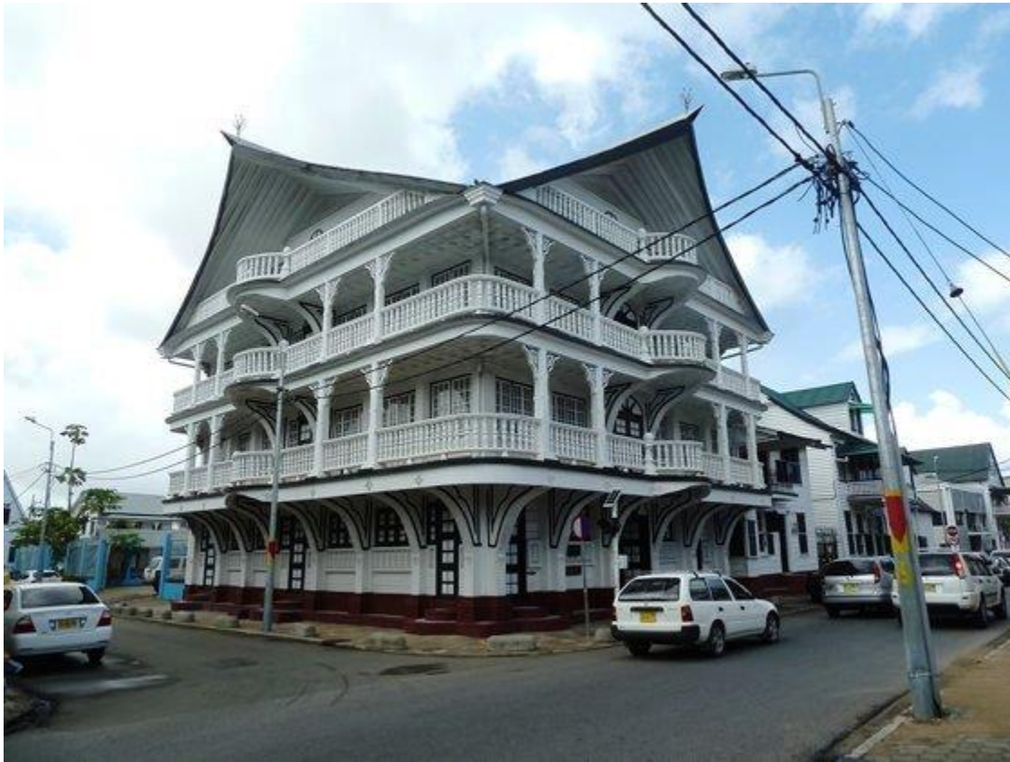
Parimaribo - a UNESCO World Heritage Site