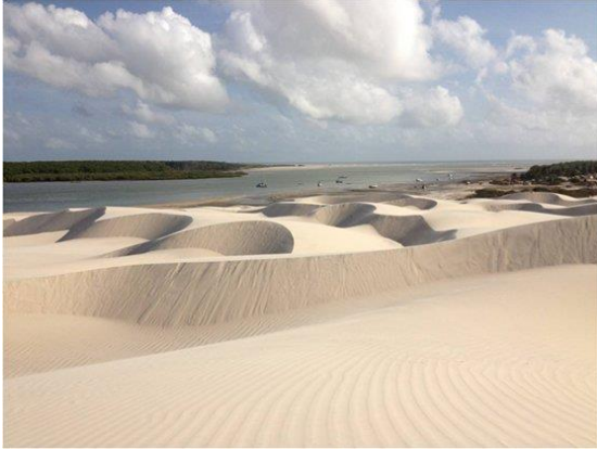
The sand dunes of Ilha Dos Lençois

Brazil). They live in mud-floored huts intricately woven from palm fronds, and fish in the estuary for the largest, juiciest prawns you have ever seen. Rarely exposed to tourism, they are reserved but not hostile. There is no agriculture on the island because it consists only of enormous sand dunes. It is "Lawrence of Arabia" meeting "The African Queen".