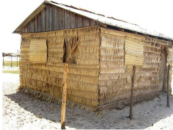
Hut made from palm fronds

We had by now caught up with our schedule and with only one more passage of 600nm to get Sally and Lawrence to their departure point of Kourou in French Guiana we were to have the luxury of staying here for four days. None of us wanted to leave. The epicentre of the small village is the small bar/store on the beach, just opposite where we had anchored, and where we slowly got to know the inhabitants. In between visits to the village, we walked over the wind-shaped dunes which were every bit as varied and beautiful as the icebergs that I had seen just a year before. It is quite the most enchanting place I have ever been to.