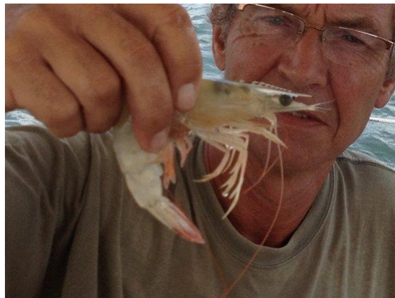
and the biggest juiciest prawns imaginable